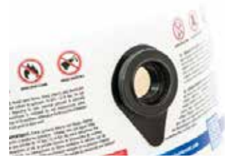
black arrow position