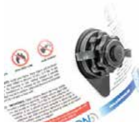
black inflation valve