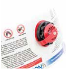
red overpressure valves